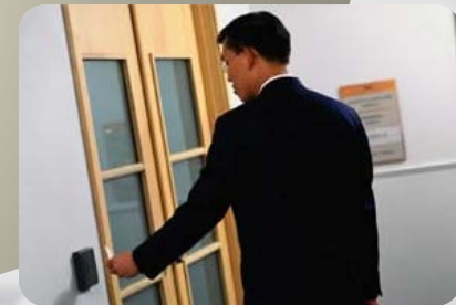
Physical Access Control