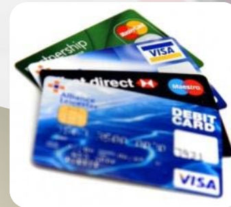
Payment system / e-Purse