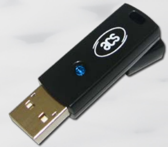
CryptoMate64 USB Token

For further detail about CryptoMate, please visit: