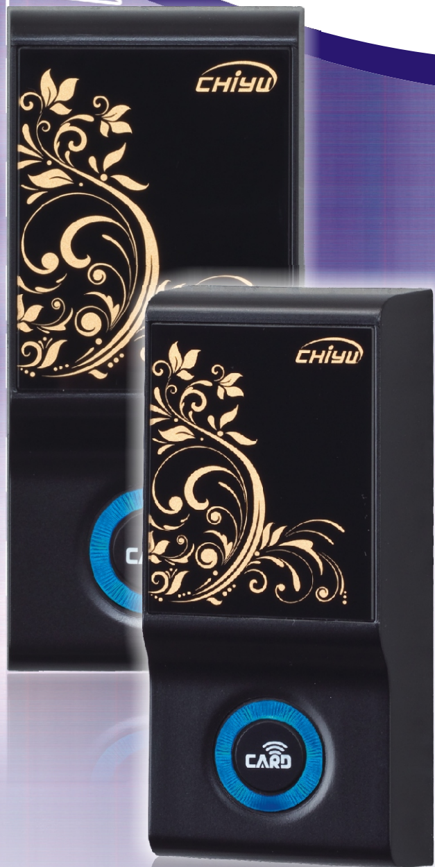
WR-E2/M2 (Black / Silver)