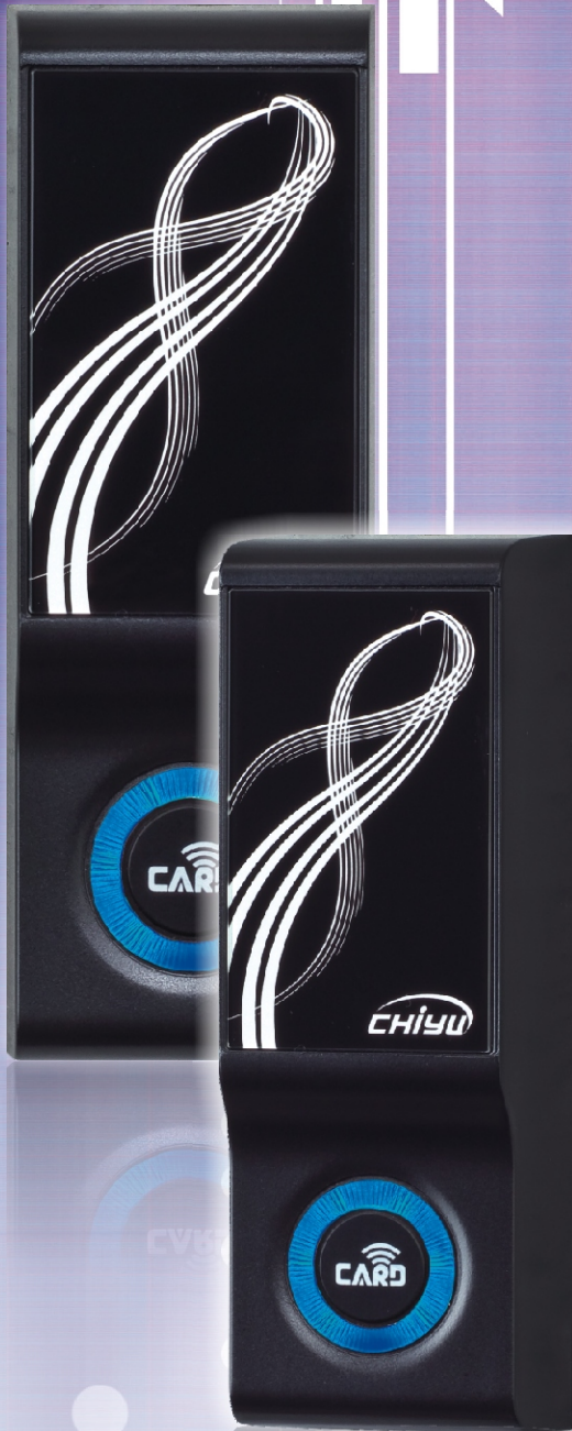
WR-E1/M1 (Black / Silver)