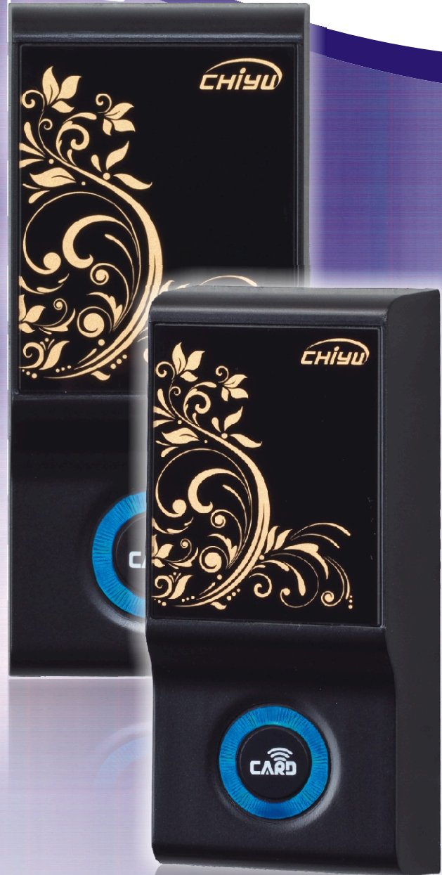
WR-E2/M2 (Black / Silver)